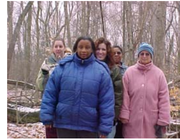
Candidates learning teamwork skills by completing a “low ropes” course in Toledo pilot.